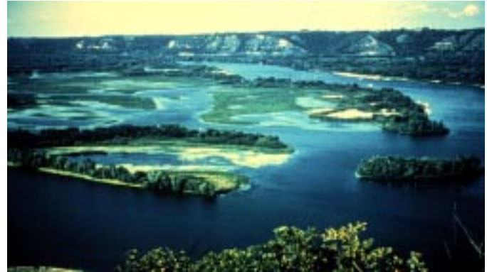
Figure 1. Aerial view of Upper Mississippi River slackwater navigation project habitat.

The sands that remain in the navigation channel occasionally block navigation traffic. But these are promptly removed by U.S. Army Corps of Engineers (Corps) channel maintenance dredges and pumped downstream into the main channel (thalweg) or side cast to nearby shorelines, or oftentimes in the past into sensi-