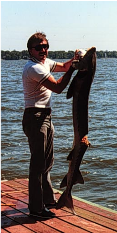
Figure 3. Adult lake sturgeon washed ashore in Upper Mississippi River navigation Pool 15, the apparent victim of injury by a large boat

dwelling fish are dislodged and carried right into the props of these huge boats.